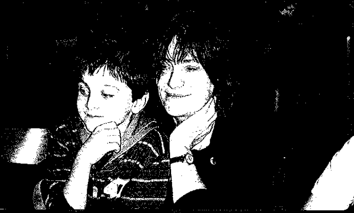
Alpha and My Faith.