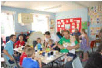
Breakfast including real South African porridge made with genuine mealie meal