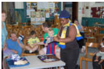
The chocolate game