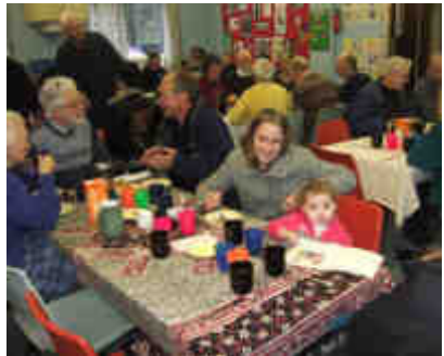
All ages tucking in!

Displays about our eight mission partners were set up around the church. We divided into two groups and each group moved round to four mission displays spending fifteen minutes at each. Before we prayed our mission co-ordinators updated us on each organisation and told us of any specific prayer needs.