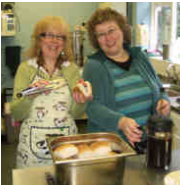
Two of our wonderful chefs

Following our prayer time we adjourned to the meeting room where we found a wonderful breakfast of toast, cereal, hot bacon cobs and croissants (warmed to perfection) waiting for us.