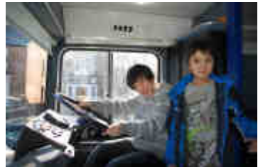
A couple of new drivers?

Listen to Alan’s testimony at st-thomas-brampton/testimonies.html#apark