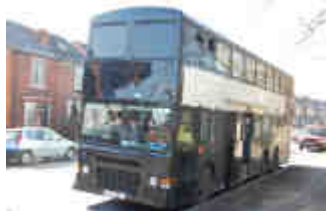
The original bus (left) and the second one