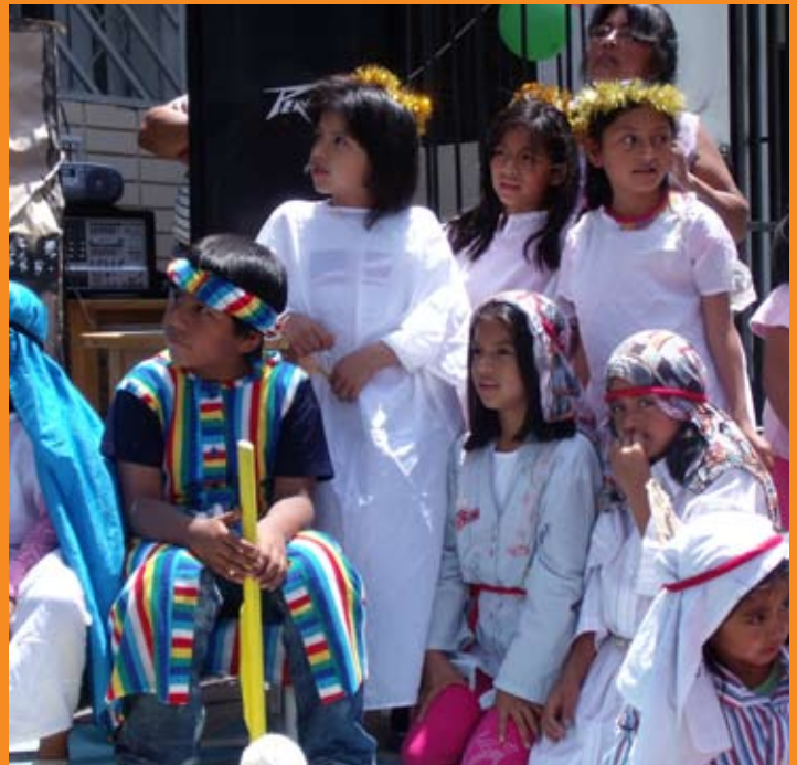
Top: Christmas treat for young people from San Patricio