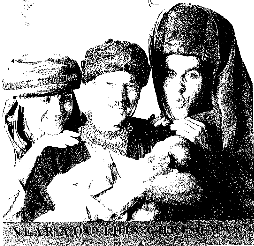
NEAR YOU THIS CHRISTMAS!